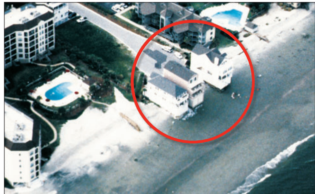
Figure 1. Well-built but poorly sited building.

A well-built but poorly sited building can be undermined and will not be a success (see Figure 1). Even if a building is set back or situated farther from the coastline, it will not perform well (i.e., will not be a success) if it is incapable of resisting high winds and other hazards that occur at the site (see Figure 2).