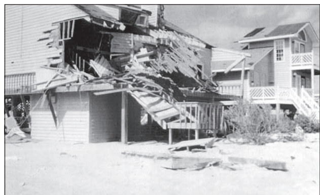
Figure 2. Well-sited building that still sustained damage.